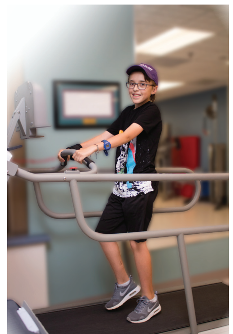
Leo can and you can too!