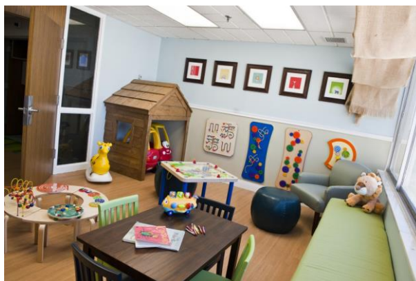
Cathy Green Interiors, photo credit Barb Furgurson

I can play with toys, read a book, or play on the iPad while I wait.